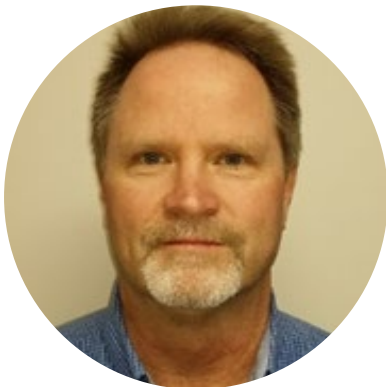
John Abernethy MD