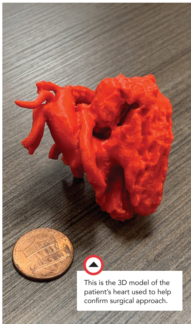
This is the 3D model of the patient's heart used to help confirm surgical approach.

"There was a ventricular septal defect or VSD and no connection between the heart